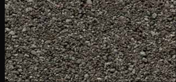
OXFORD GREY ●