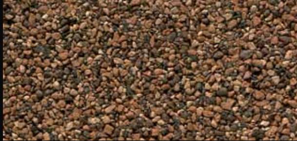
RUSTIC CEDAR ●◆