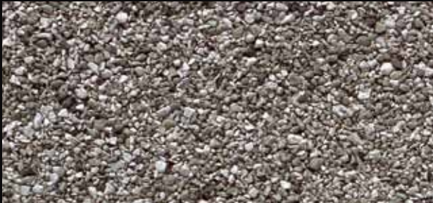
GREY BLEND ●