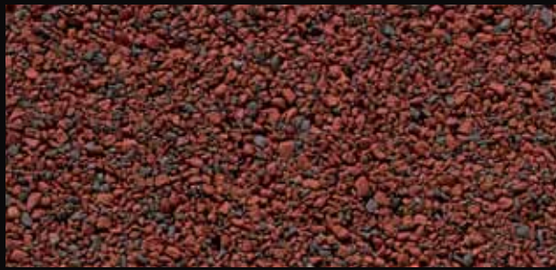
TILE RED BLEND ●