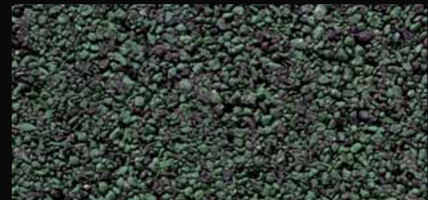
EMPIRE GREEN BLEND ●

Elite Glass-Seal® available in colors marked with a ● Glass-Seal available in colors marked with a ◆