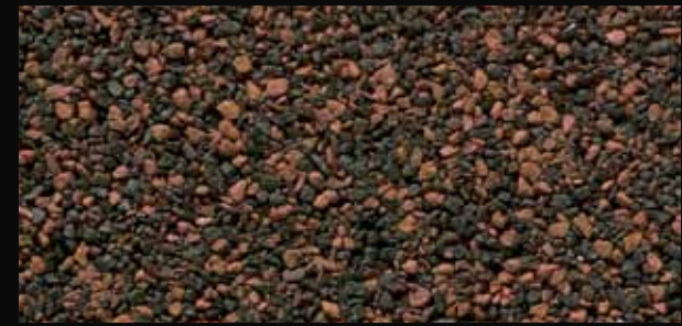
RUSTIC HICKORY ●◆