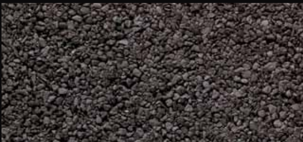
RUSTIC BLACK ●◆