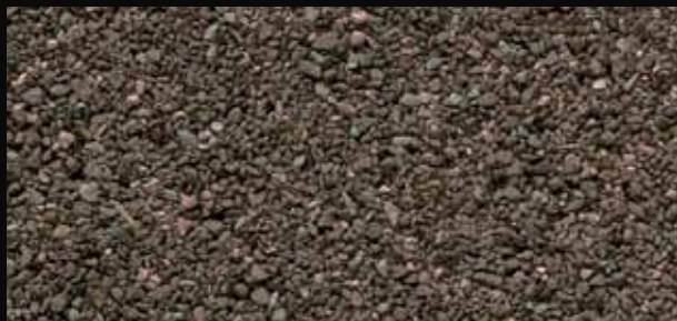
WEATHERED WOOD ●◆