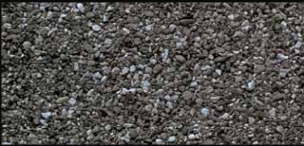
ANTIQUÉ SLATE ●◆