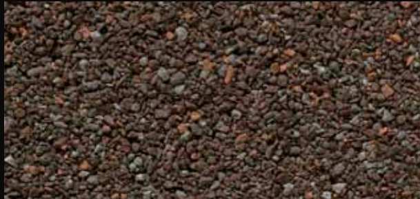
RUSTIC SLATE ●