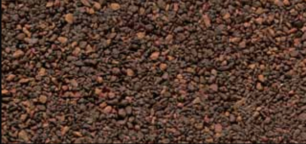
TWEED BLEND ●◆